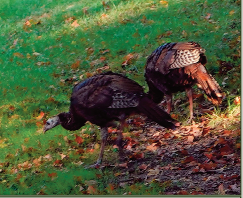
A flock of turkeys visited our back yard. As they ambled and pecked they found something good to eat among the leaves. Once, a 'Peeping Tom' hen sat on an Infirmary widow sill to catch a glimpse of a sister.