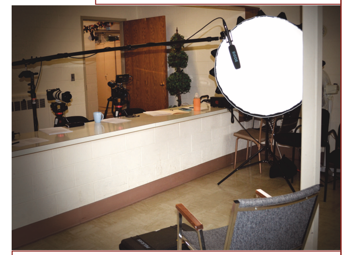
Openlight Media, a digital platform ministry of the Dominican Sisters of Mary, Mother of the Eucharist, came with film crew to produce, for us, a vocation video. Above is the 'hot seat' in front of a huge light where a few sisters sat to tell the story of the Lord's call and their journey to the Monastery.